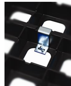
Figure 2 PADLOC® Connection Device