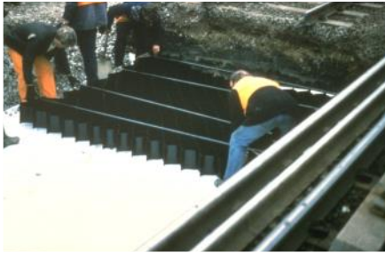
Placing GEOWEB sections over a geocomposite drainage layer.