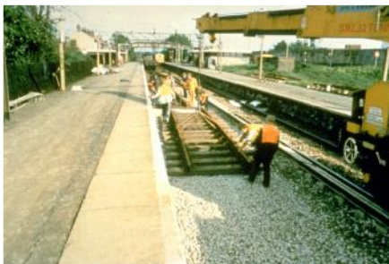
Additional stone is brought in to complete the ballast. The track is then repositioned in place.