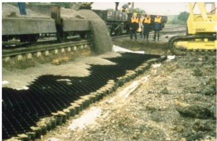
Stone is deposited, spread, graded and compacted in the GEOWEB sections.