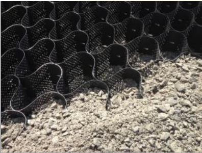
GEOWEB 3D Soil Confinement System stabilizes track subballast layer and reduces cross-section depth up to 50%.