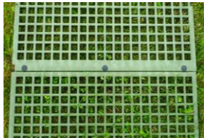
Rivets: End-to-End Connection