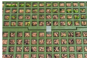
Side Clips: Side-to-Side Connection