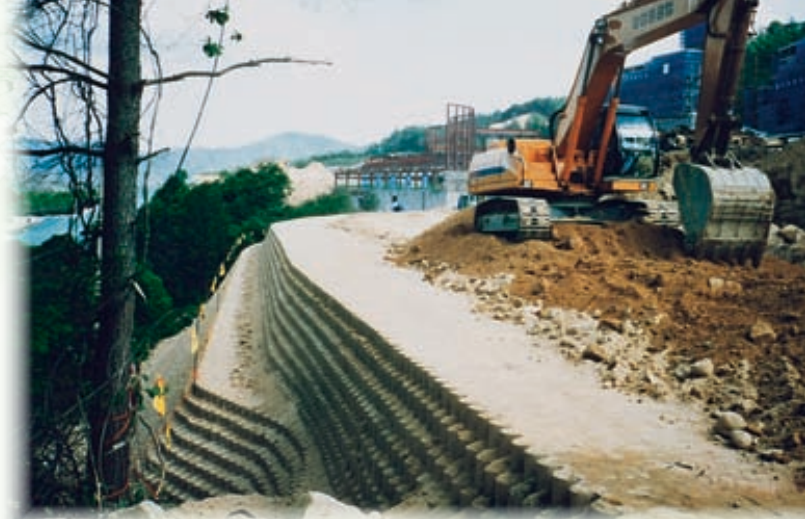
Project photos courtesy E & S Engineering