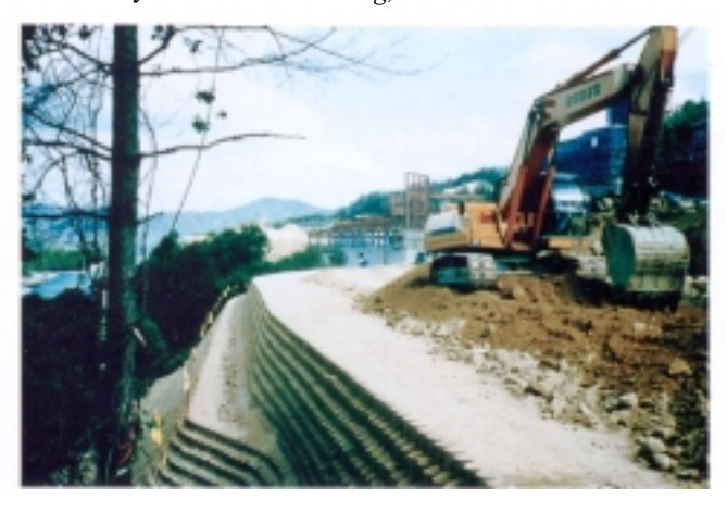
Photo 2. The Geoweb® earth retention structure conforms to tight space constraints and differential settlement.