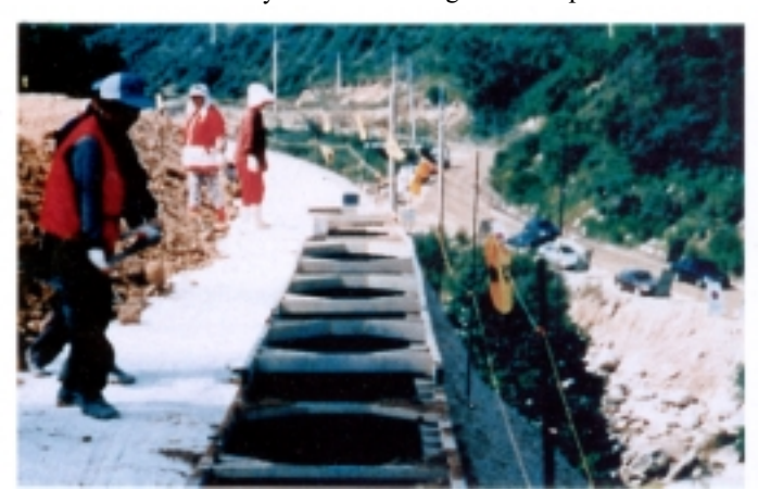
Photo 1. Stretcher frames are used to keep the Geoweb® sections expanded during infilling operations.

Engineer: Unisystems Korea, contact Junsik Kang, Tel 82 374 34 0771