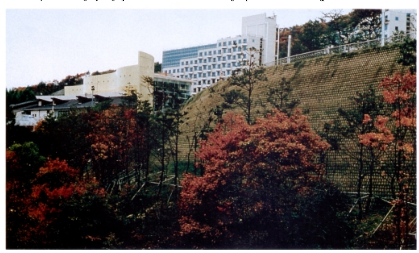
Photo 3. The completed Geoweb® wall measures 200 m (650 ft) in length with heights from 6 - 14 m (20-46 ft).