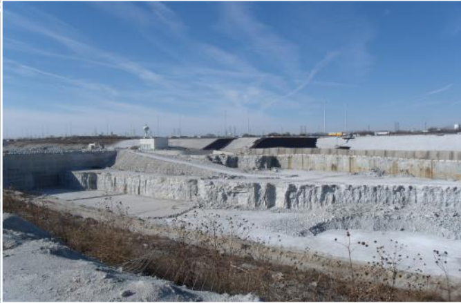
McCook Quarry BEFORE THE GEOWEB SYSTEM INSTALLATION