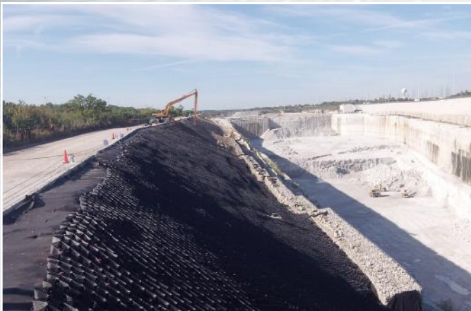
McCook Quarry DURING THE GEOWEB INSTALLATION PROCESS