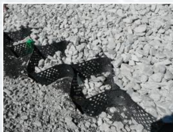
An up-close look of aggregate within the GEOWEB confinement system.