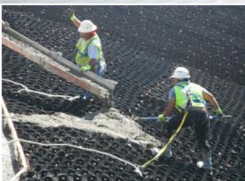
Concrete being poured within the GEOWEB structure's cells.