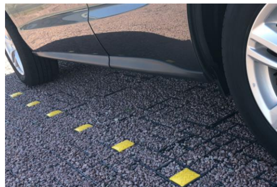
Figure 3. GEOPAVE SNAP Delineators installed for parking lanes