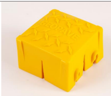
Figure 1. GEOPAVE SNAP Delineator